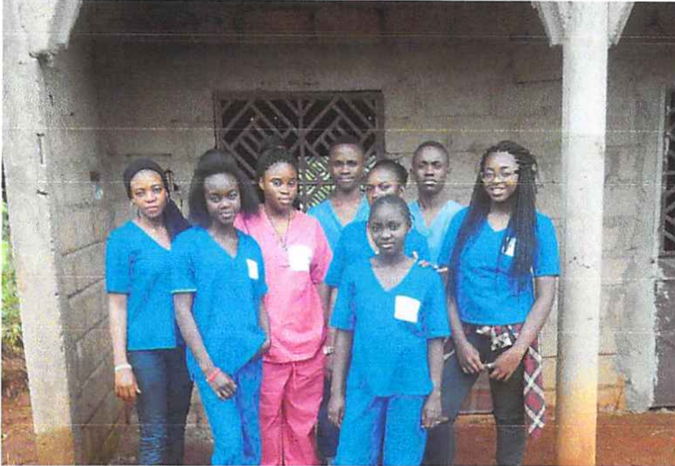
The SHAHICA team this year