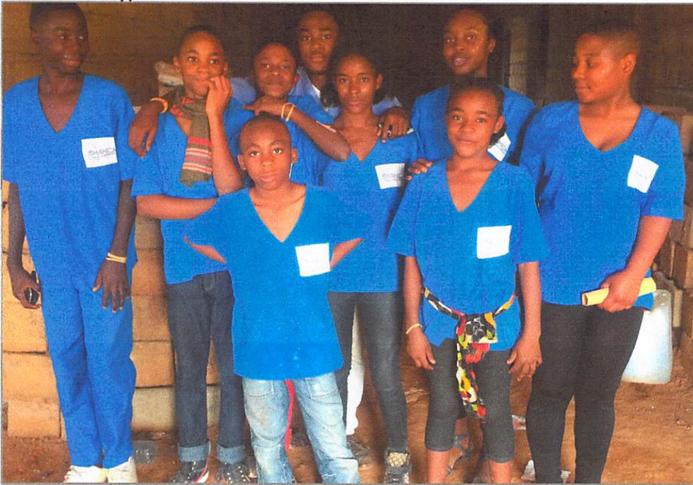
SHAHICA youth team!!